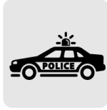
STAY SAFE ON CAMPUS