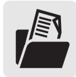
FILE A REPORT