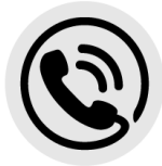
GET HELP NOW