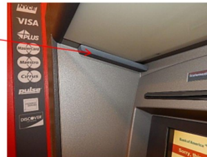
Location of PIN capturing Device camera (Usually placed somewhere above PIN pad)