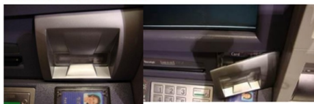
Skimmer placed over card slot & Partially removed