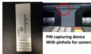
PIN capturing device With pinhole for camera