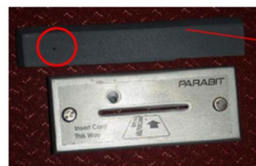
Door Access Device Skimmer & PIN Capturing Device

Lastly, cardholders and consumers should be aware of their rights and responsibilities as a cardholder of the appropriate financial institution. Many companies offer fraud protection for little or no cost to the cardholder. Make sure you are utilizing all available benefits to ensure you are protected from credit card and/or identity theft.