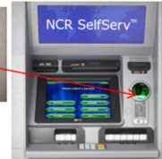
Skimmer removed from ATM

For more information regarding credit card fraud, visit https://www.consumer.ftc.gov/articles/0216-protecting-against-credit-card-fraud .