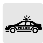
STAY SAFE ON CAMPUS