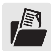
FILE A REPORT